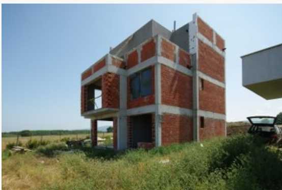
Villa Una 7 / Villa Duo 10 & 11