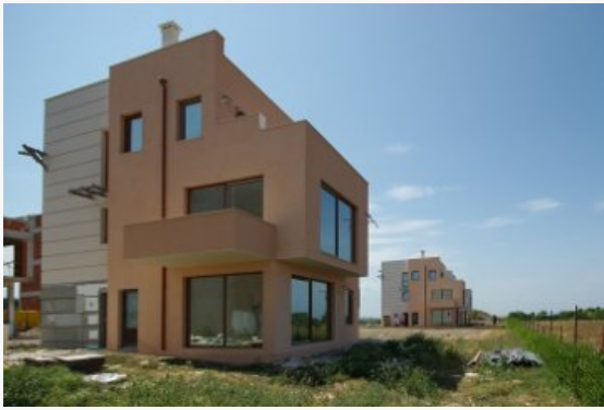
Villa Una 5 & 2 / Villa Una 5 & 6 & 7