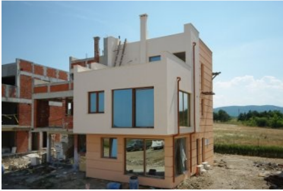
Villa Duo 14 & 15 / Villa Duo 16 & 17