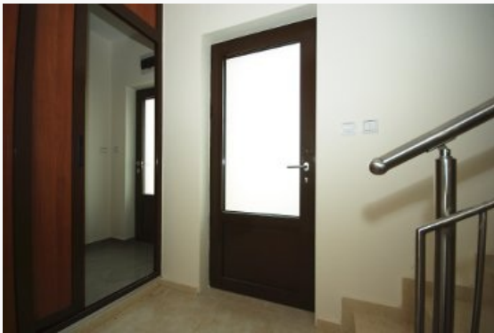
Separate entrances, sliding door