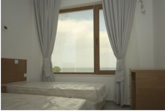
Villa Una 2