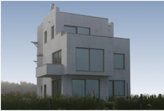
Villa Una 1