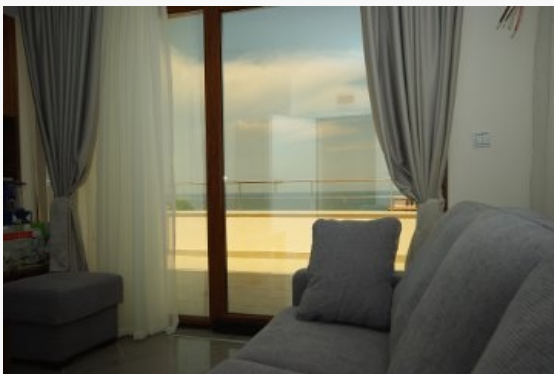
Villa Una 2