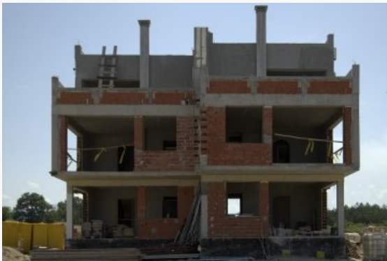
Villa Duo 12 & 13 / Villa Duo 14 & 15