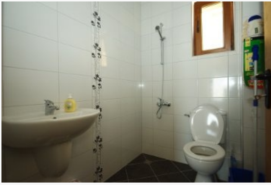
Villa Una 2