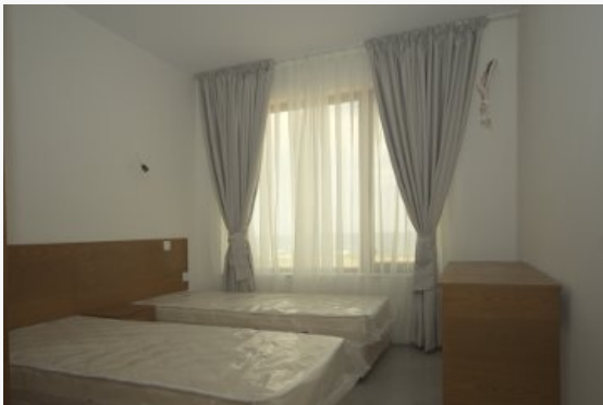
Villa Una 2