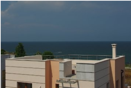
Villa Una 2