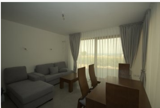
Villa Una 2