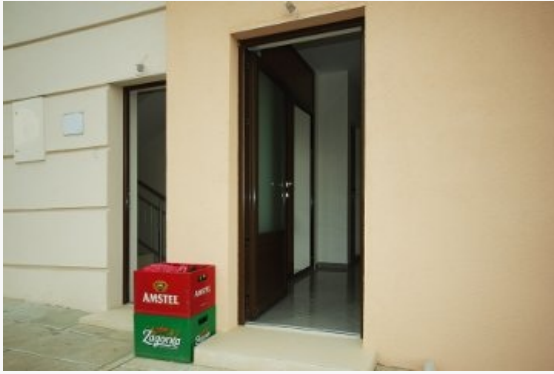
Separate entrances, sliding door