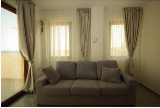
Villa Una 2