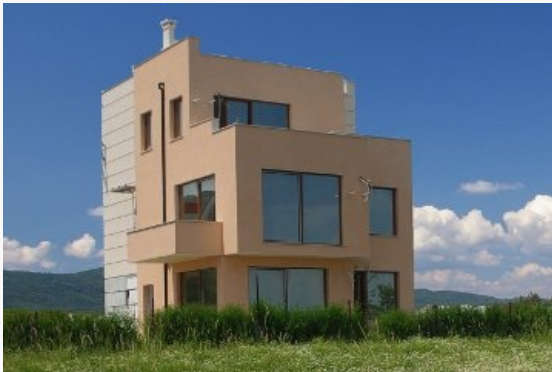
Villa Una 2